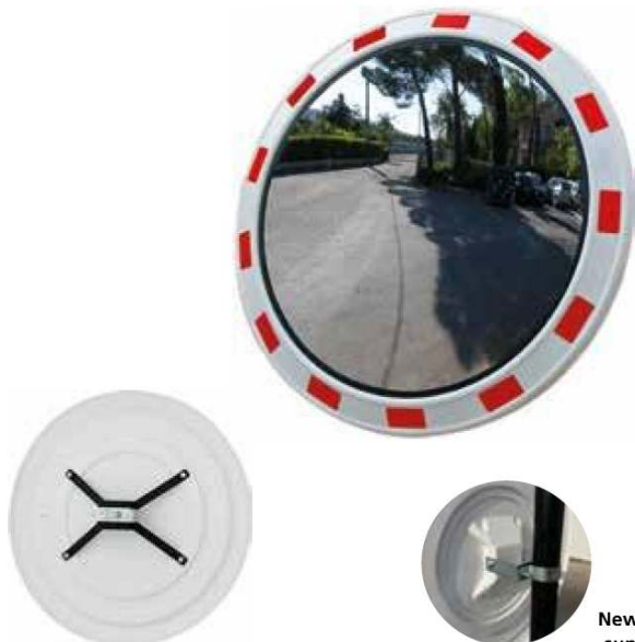
New rear support