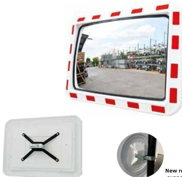
New rear support